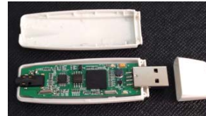
Module in plastic case